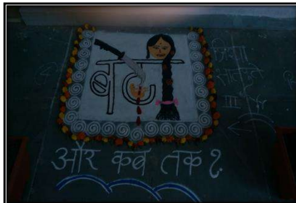
Rangoli Competition on “Beti Bachao Beti Padhao”