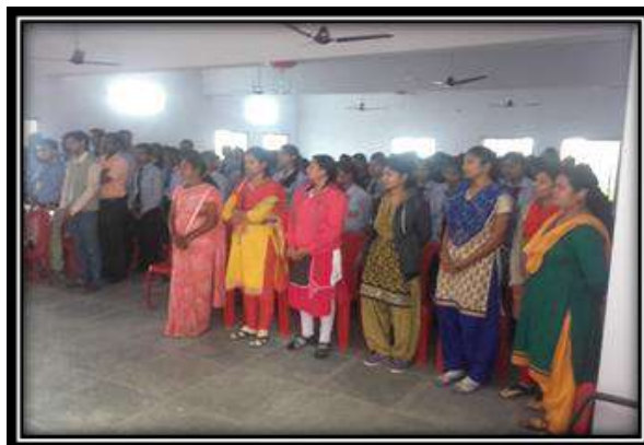
Faculty and students during a seminar on women's safety

The students of Hi-Tech College of pharmacy were actively participated in this seminar and they acquired knowledge about woman safety. Woman safety seminar was organized in the Hi-Tech College of pharmacy Chandrapur on 27 February 2018. It was organized for giving the information about safety and self-protection of women.