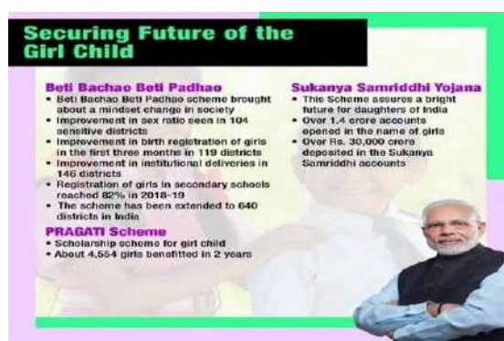
Presentation on government schemes