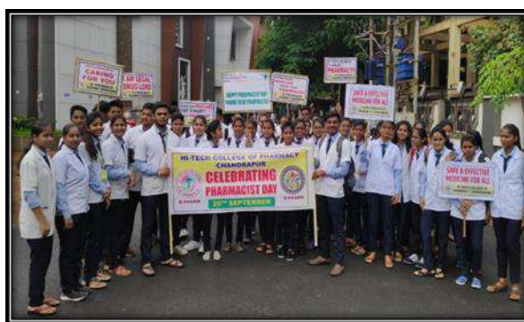
Pharmacist Day Celebration