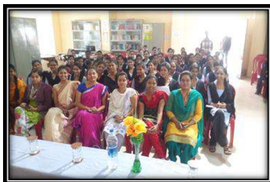
Students & Faculty member attained the program

Hi-Tech College of pharmacy organized the Beti Bachao Beti Padhao program under Gender Equality program on 03 January 2017. A total of 40 students were presented in this program. The students and teaching faculty highlighted that the frequency of female foeticide in India is increasing day by day. This program created awareness about female foeticide.