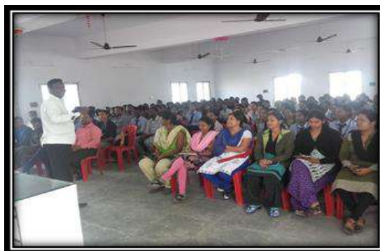
Workshop on personality development