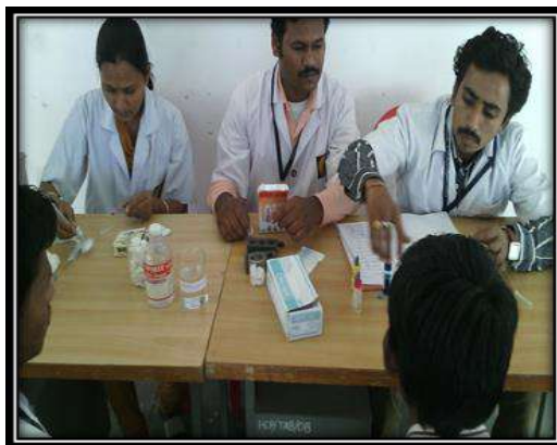
Blood group detection camp

Every year 25 September is celebrated as world pharmacist day. Hi-Tech college pharmacy has organized a Blood group detection camp on the occasion of world pharmacist day. A total of 85 students were present for this program.