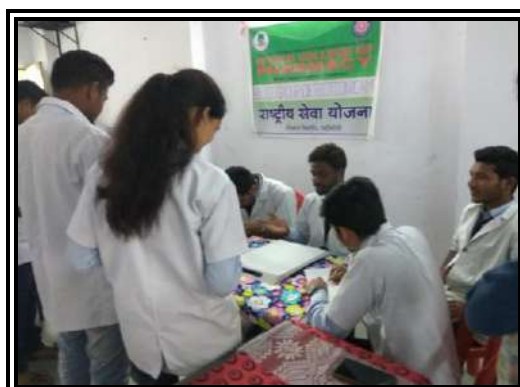
Blood group detection camp

Every year 25 September is celebrated as world pharmacist day. Hi-Tech college pharmacy has organized a Blood group detection camp on the occasion of world pharmacist day. A total of 75 students were present for this program.