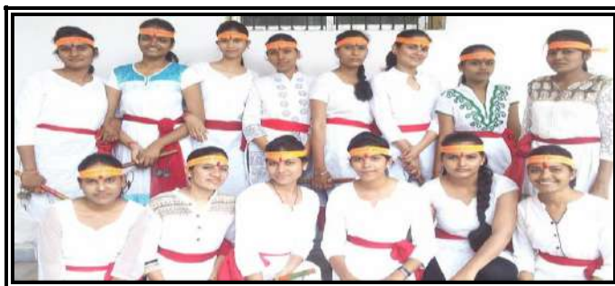
Students participated in a street play

The street play was conducted on 03 March 2016 on the campus of Hi-Tech College of Pharmacy. All teaching and non-teaching staff and all students attended the Street play. The theme of the street play was “Save Girls Child”. A total of 14 girls were participated in this street play.