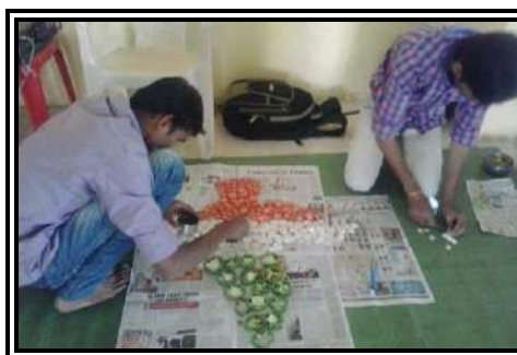
Students participated in a Salad decoration competition and breathing techniques