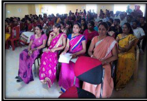
International Woman's Day Celebration

Hi-Tech College of pharmacy has organized International woman's Day on 08 March 2019. Under this program teaching faculty had given information to the students regarding creating awareness about women's rights as Women's rights around the world is an important indicator to understand global well-being. A total of 115 girls were present in this program.