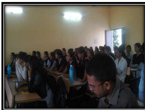
Presentation on Helpline Numbers