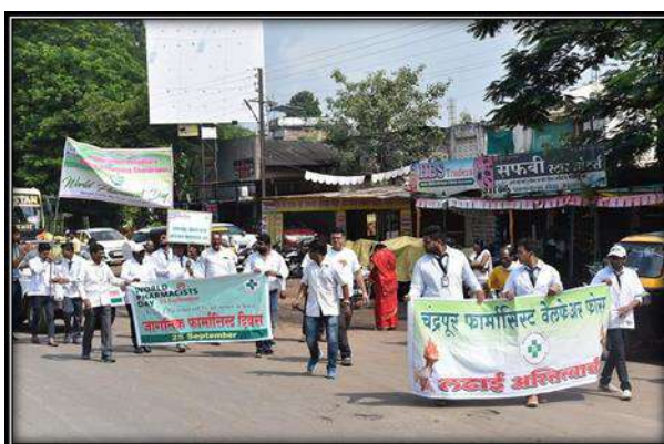
Pharmacist Day Celebration