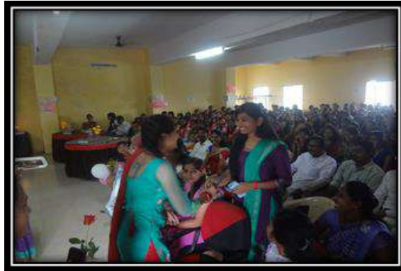
Women's Day celebration

about women's rights as Women's rights around the world is an important indicator to understand global well-being. All students were present.