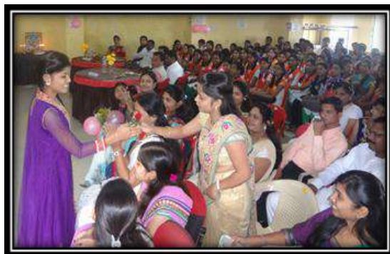
International Women's Day Celebration