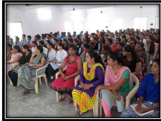
Celebration of International Women's Day