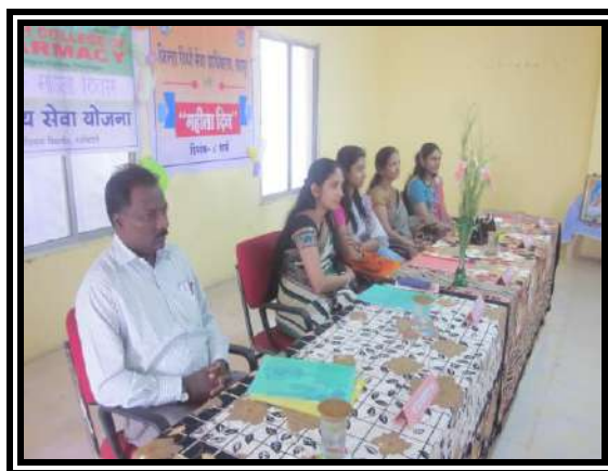
Celebration of International Women's Day

Hi-Tech College of pharmacy has organized International women’s Day on 08 March 2016. Under this program, Guest had shared their valuable thoughts with students regarding creating awareness about women's rights as Women's rights around the world is an important indicator to understand global well-being.